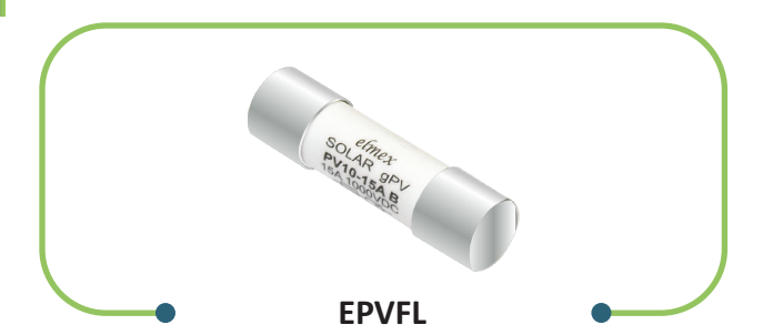
'elmex' gPV Fuse Link suitable for 1000V DC photovoltaic applications.